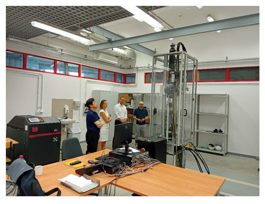
Fig. 1 Visit to Materials strength lab