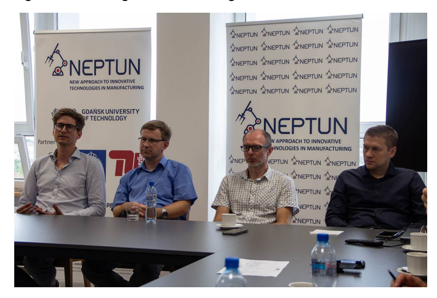
Fig. 4 Focus group – GDANSK TECH scientists

digital twins. The attendees agreed that the area for cooperation is very wide and that it can be strengthened through staff exchange between the institutions.