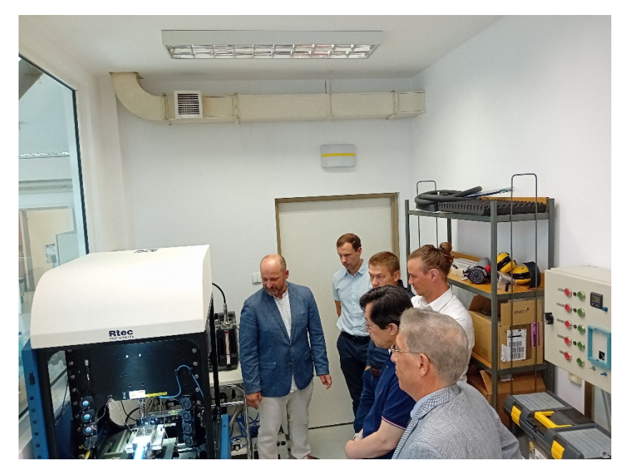
Fig. 2 Visit to tribology lab

Project: 101079398 — NEPTUN — HORIZON-WIDERA-2021-ACCESS-03